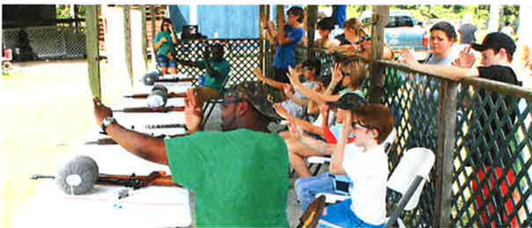
Teachers and learners use their hands to represent sites as they practice looking at targets.

The morning opened with many of the 4-H clubs in Levy County setting up tables to show visitors what is happening in their clubs. A child may join however many clubs that he or she wants, and believes they can contribute to and participate in.