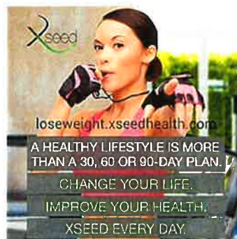
Click Ad Above to Go to Website.